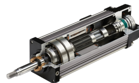
Exlar's GSX Series actuator integrates a servo motor and roller screw for a robust, clean and efficient electric solution.